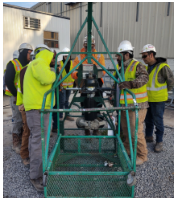
Cable Climber Training in Kansas City, MO