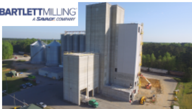
Bartlett Milling // Flour Mill Expansion Wilson's Mills, North Carolina