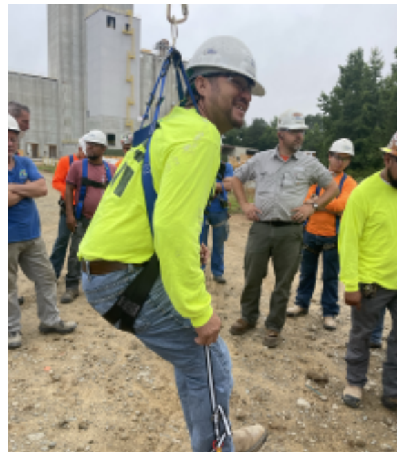
Fall Protection Training in Wilson's Mills, NC

Todd & Sargent's Safety Program is about more than audits and inspections. We're committed to supporting our field crews by providing training and resources for the hazards experienced on their job at the stage it's at. We work to keep crew members safer and more aware to help them to develop skills that can be used for the duration of the job and their careers. For every person at T&S, Safety is job #1 , and we're excited to be part of that!