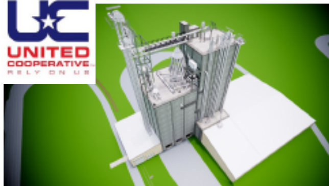
United Cooperative // Dairy Feed Mill Waupun, Wisconsin