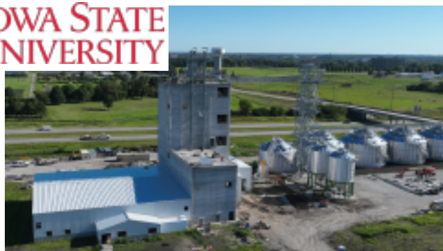
Iowa State University // Feed Mill Complex Ames, Iowa