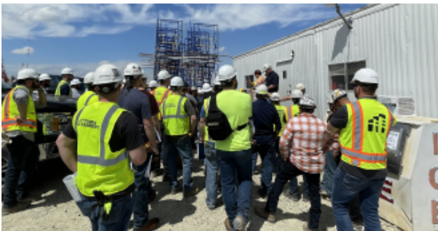
Pre-Slip Safety and Operations Training in Phillipsburg, KS