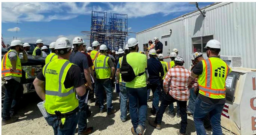
Pre-Slip Safety and Operations Training in Phillipsburg, KS