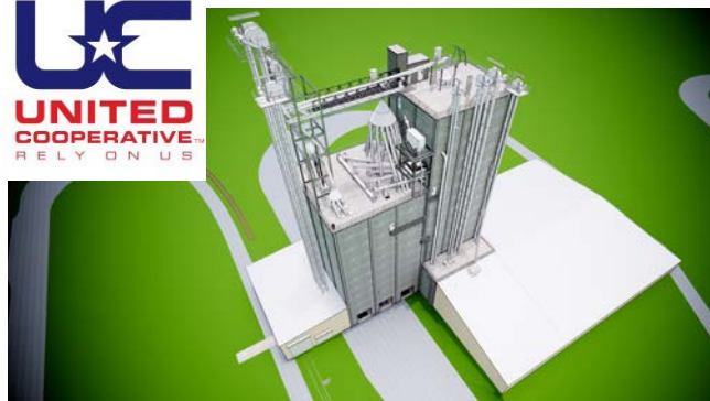
United Cooperative // Dairy Feed Mill Waupun, Wisconsin