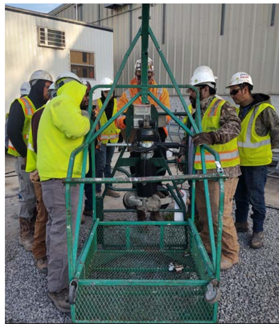
Cable Climber Training in Kansas City, MO