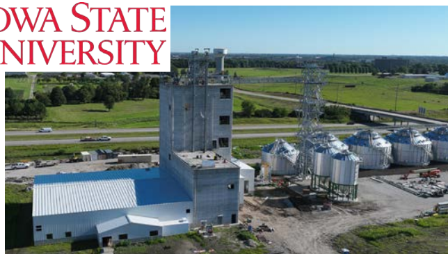
Iowa State University // Feed Mill Complex Ames, Iowa