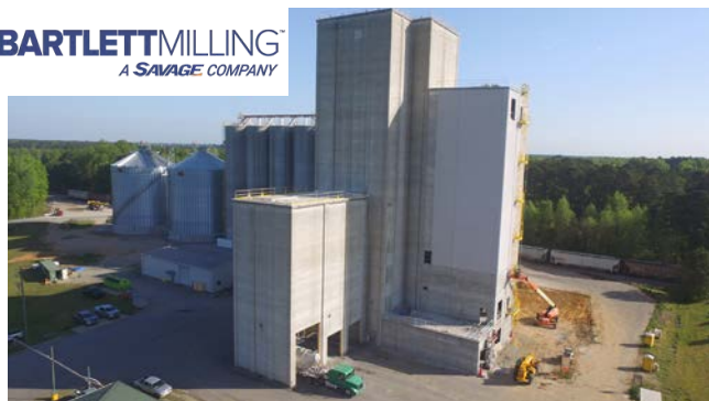
Bartlett Milling // Flour Mill Expansion Wilson's Mills, North Carolina