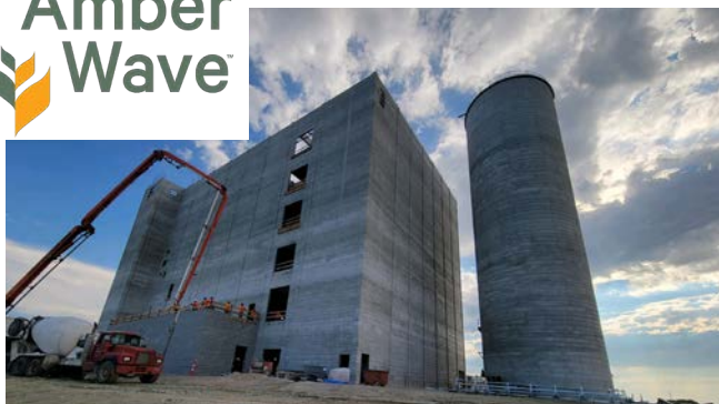
Amber Wave // Wheat Protein Ingredients Facility Phillipsburg, Kansas