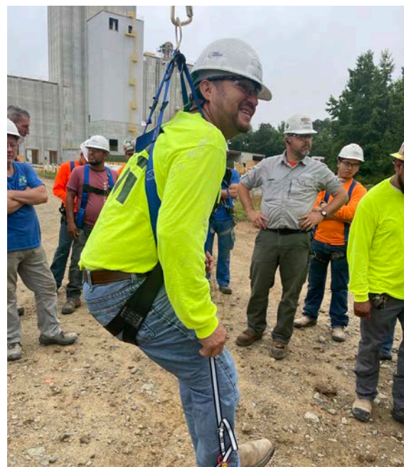
Fall Protection Training in Wilson's Mills, NC

Todd & Sargent's Safety Program is about more than audits and inspections. We're committed to supporting our field crews by providing training and resources for the hazards experienced on their job at the stage it's at. We work to keep crew members safer and more aware to help them to develop skills that can be used for the duration of the job and their careers. For every person at T&S, Safety is job #1 , and we're excited to be part of that!